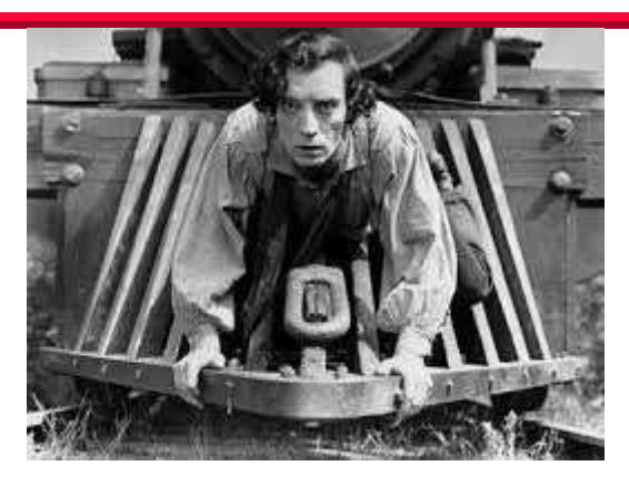
THE GREAT LOCOMOTIVE CHASE SATURDAY, AUGUST 13th

Contact media@slorrm.com or call 805-548-1894