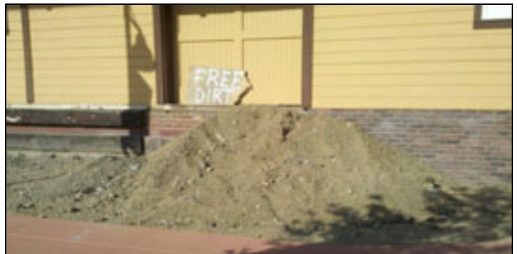
The mountain of dirt removed from inside the building was offered free to the public.