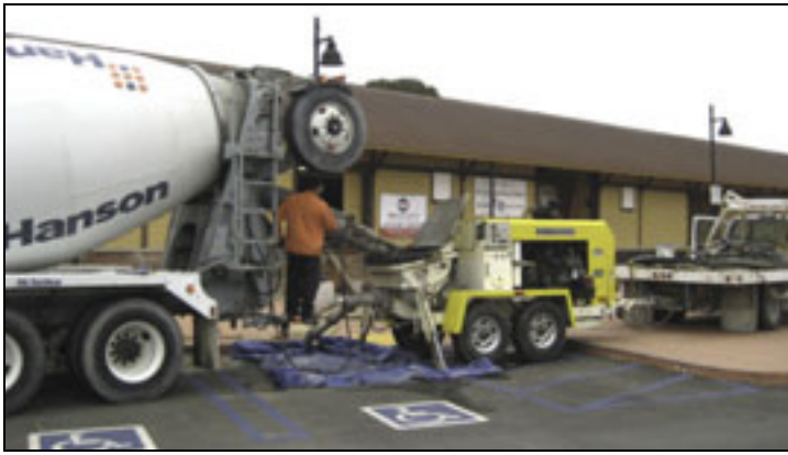
On June 6, 2012, concrete was pumped into the Museum's Freighthouse building to finish the interior flooring. Since then the plumber has finished the rough plumbing, the electrician has finished the rough conduit and most of the walls have been framed. The model railroad platform has been built and Alpha Fire has installed the platform sprinklers. RK Builders has assured us that the restrooms will be ready for the October 6th open house.