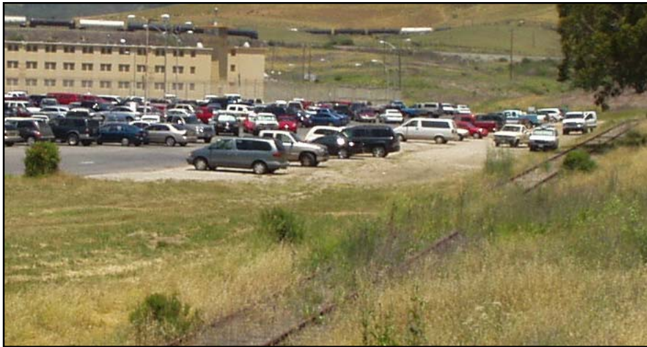
Track ran from just north of the Stenner Creek Trestle, through the California Mens Colony, to Camp San Luis Obispo. A freight train traversing the horseshoe curve on the Cuesta Grade mainline is just visible at the top of this picture

In early 1941 the United States was anticipating the involvement in war. The strategic location of the California coast and its ports required the construction of military installations. At these camps, soldiers and supplies could be quickly moved to the ports for shipment overseas.