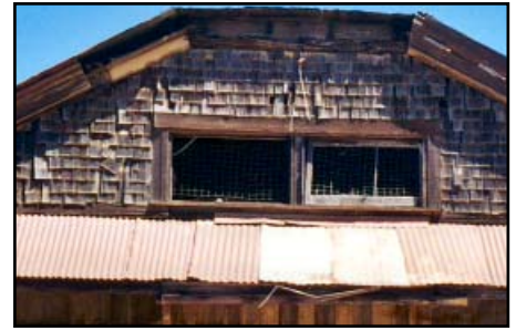
Shingles on the west (or south) end of the Freighthouse might get replaced using extra money from current rehab contract.