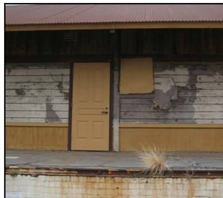
People doors were also installed.