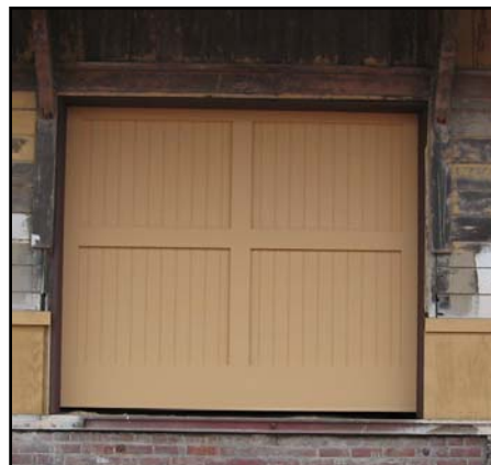
Simulated tongue-in-groove plywood was used to replace the freight doors.