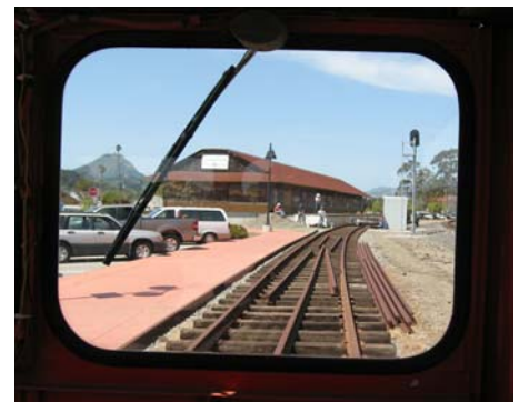
A view from the cab.

Below, a view from the cab as the Speeder highballs it back to the Freighthouse after a safe trip to the caboose. One of the crew was heard to comment that the ride was "just as smooth as if it was welded rail."