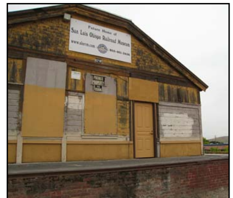
Next will be the window replacement.