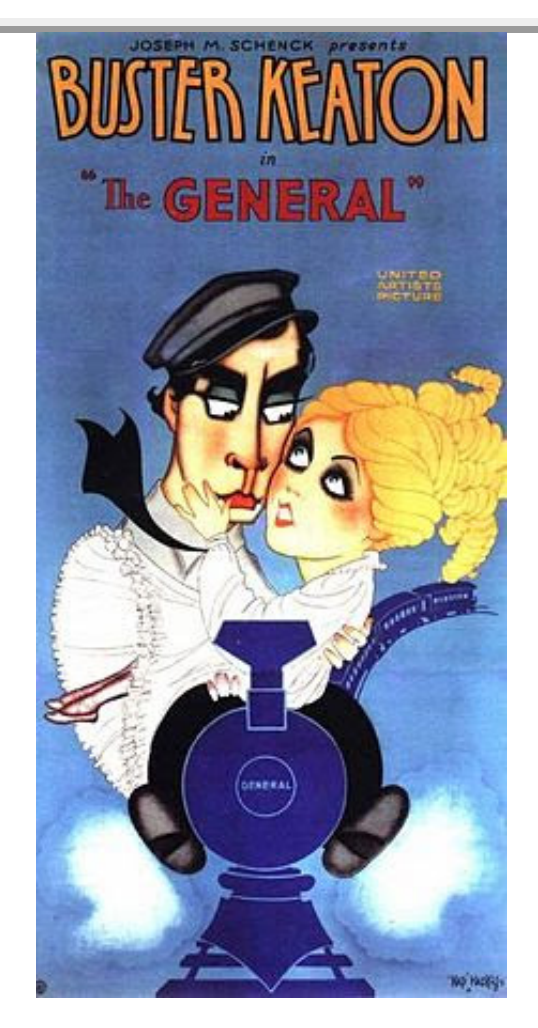
THE GREAT LOCOMOTIVE CHASE

Join us as we celebrate the 122nd anniversary of the arrival of the Southern Pacific Railroad to San Luis Obispo in 1894. We will have activities on the platform including railroad artwork for sale, a railroad swap meet, kid's play area, food, wine tasting from Pomar Junction Winery and music by South Street Roundhouse. Admission to the Museum is only $3 for adults, $2 for kids 4 to 15. (Members are FREE). We can always use donations of Brio, Thomas or similar train toys for the kid's area. Contact media@slorrm.com to rent a table on the platform or to donate train toys. Thanks for your help!