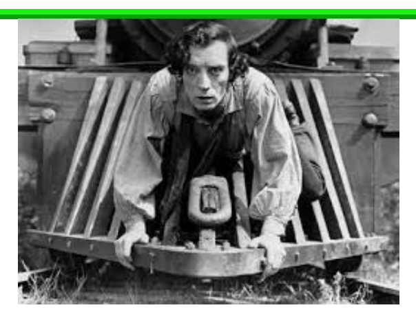
THE GREAT LOCOMOTIVE CHASE SATURDAY, AUGUST 13th

Now, we need to ask for help again. The windows, made of lexan, have been badly weathered. It is impossible to see anything through them. We need to repair or replace all eleven of them. Some can be polished. Some must be replaced. The average cost to repair or replace a window is $200. We are putting out a call for donors who are willing to pay for a window. If you can help, please contact media@slorrm.com or come in to the Museum any Saturday. Many thanks to those of you who are willing to step up to this request. We appreciate your help.