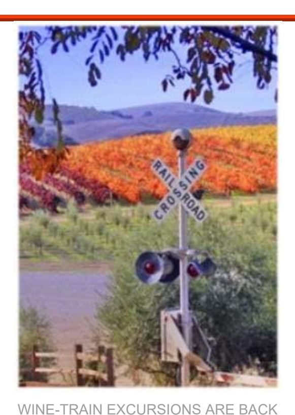
GET YOUR RESERVATIONS EARLY REMAINING 2018 DATES ARE: Friday, May 18th (Burning James & the Funky Flames) Friday, June 15th (Bear Market Riot) Friday, July 20th (Unfinished Business) Friday, August 17th (Back Pages Band) SOLD OUT Friday, September 21st (AJM Band) Friday, October 19th (JD Project)

Leave the SLO Amtrak Station at 3:35 pm on the Coast Starlight and travel north over the beautiful Cuesta Grade to Paso Robles. There you will be transported to the Pomar Junction Winery, where live entertainment and wine tasting are included in your evening. Bring a picnic or buy dinner at the