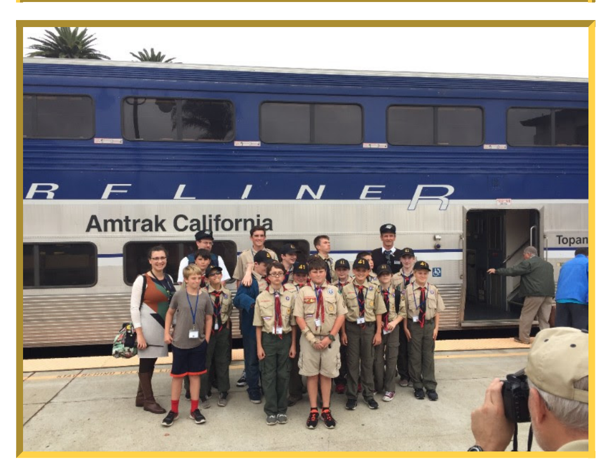
BOY SCOUT RAILROADING MERIT BADGE CLASS SUNDAY, MARCH 10, 2019 1:00 TO 4:30 PM

Spread the word to any Boy Scouts you know - with our help they can complete the BSA Railroading Merit Badge. All information is available on our website. To register and pay the $30 fee for the class, call the Museum and leave a message or send an email to media@slorrm.com. Diane will get back to you to make the arrangements. The fee covers the cost of materials and the railcar kit, which is one of the prerequisites for the class.