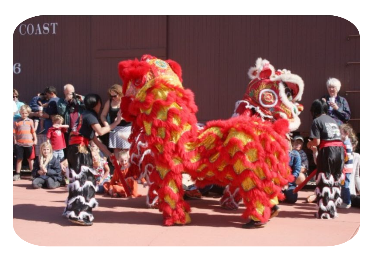
SLO TRAIN DAY SATURDAY, MAY 11th 10 am to 4 pm

By now you have probably heard that May 10th is the 150th anniversary of the driving of the golden spike in Utah, which linked the nation coast to coast. On Saturday, May 11th, we will celebrate and honor the huge contribution of the Irish and Chinese immigrants who came here to build the railroads. Watch this newsletter for the schedule of events or check our website, www.slorrm.com. Please join us for this day of history and fun.