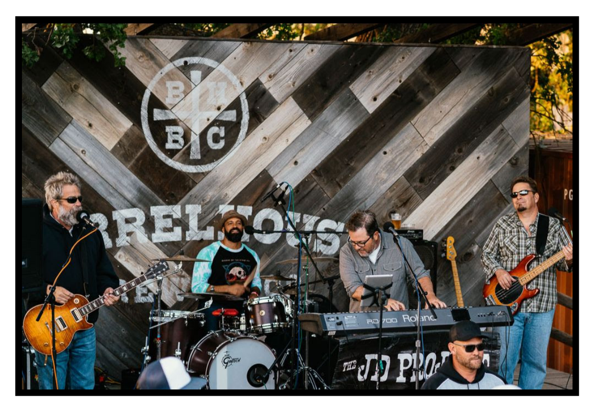
BEER TRAIN EXCURSIONS SATURDAYS, JUNE 1ST, JULY 6TH, SEPTEMBER 7TH