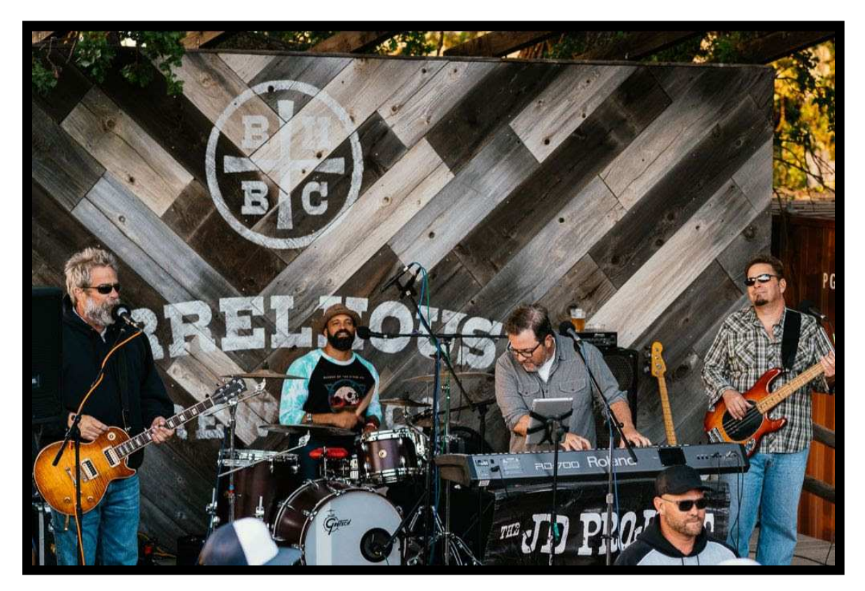
BEER TRAIN EXCURSIONS SATURDAYS, JUNE 1ST, JULY 6TH, SEPTEMBER 7TH