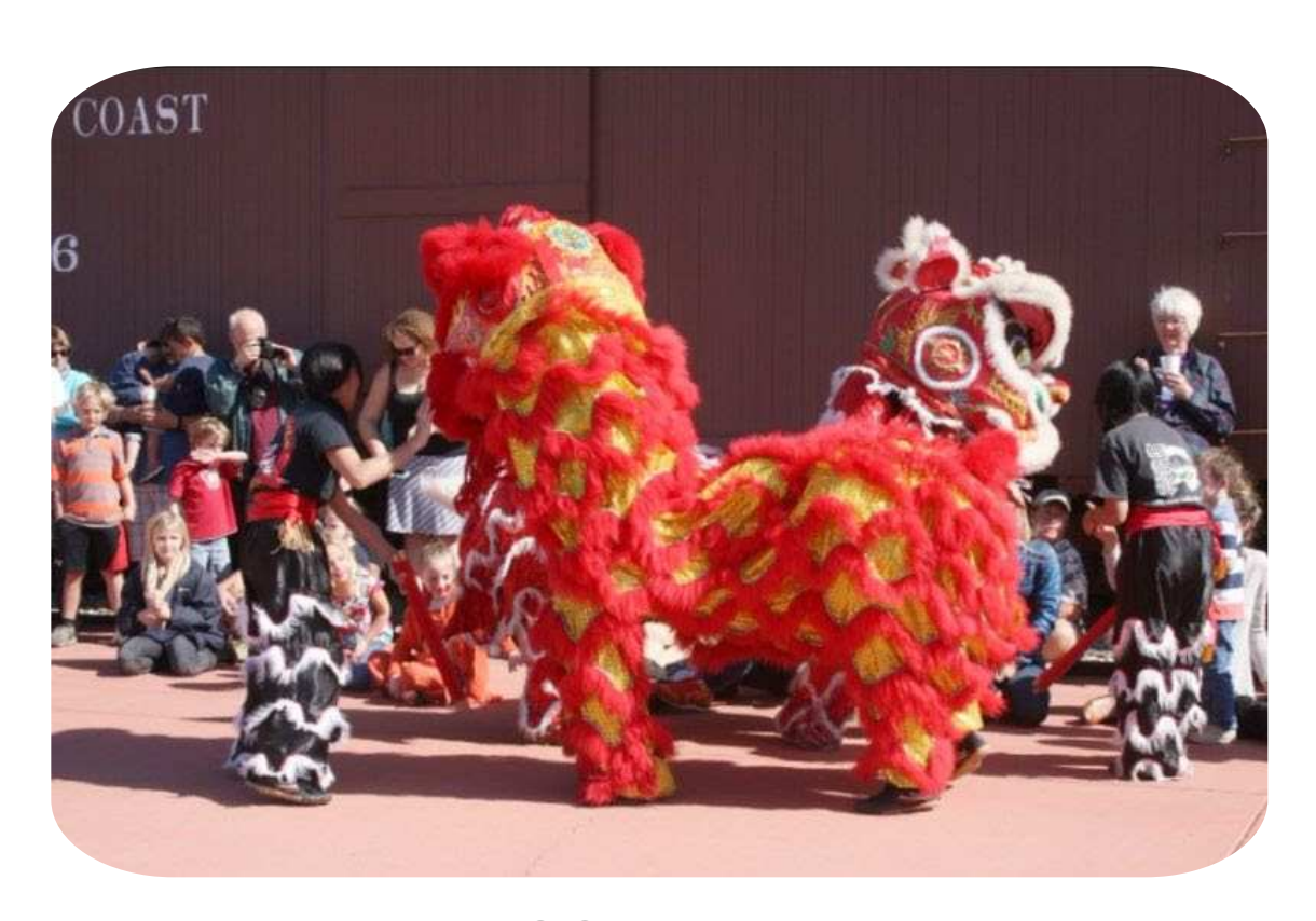
SLO TRAIN DAY SATURDAY, MAY 11th 10 am to 4 pm