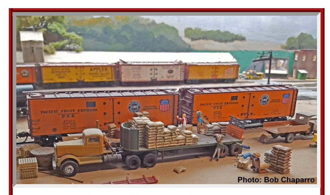
CENTRAL COAST RAILROAD FESTIVAL SATURDAY, OCTOBER 5th, 2019 10 am to 4 pm

Don't miss this once a year event! There will be lots of extra activities at the Museum on Saturday, October 5th. We'll have food, swap meet, talks, and more. Bring the young ones to play with the wooden trains. See the progress our modelers have made on the Pacific Coast Railway and Southern Pacific models. Wave at the passing trains and enjoy a beautiful day at the Freighthouse. Check our website for additional activities at other locations all around the Central Coast or check the Festival website at CCRRF.com.