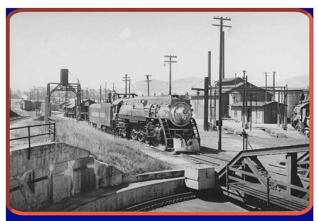
SLORRM 1ST ANNUAL COASTRAIL FRIDAY, MAY 1, 2020, 4 TO 9 PM

If you are a diehard railfan, this is the event for you. For the small fee of $25, you can spend the evening with like-minded folks watching photos and hearing stories about this year's theme - VINTAGE TRAINS. Photos will be shown from 4 to 6 pm, followed by a pizza party (included in the price) from 6 to 7, then more photos from 7 to 9 pm. Bring your own photos to share from 9 to ???. A bonus - admission to SLO Train Day (the next day) is included in your admission to CoastRail. Tickets are very limited.