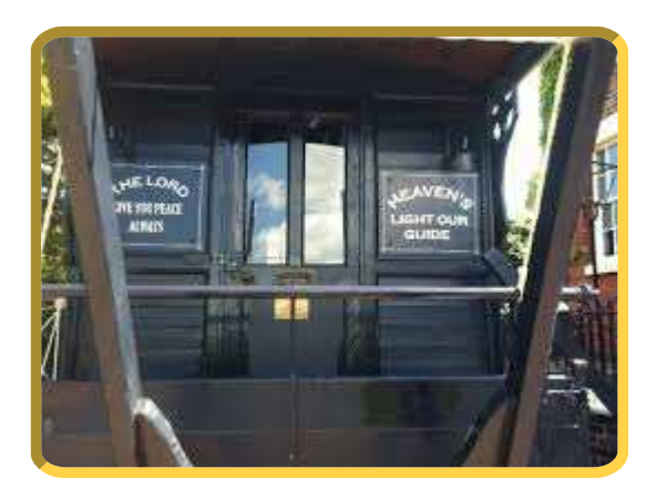
PARLOR CAR CHAT RAILROAD CHAPEL CARS SATURDAY, JUNE 13th, 10am PDT

In order to get the most from this chat, we recommend that you choose Video and Audio. We hope you enjoy the chat. Thanks for your interest.