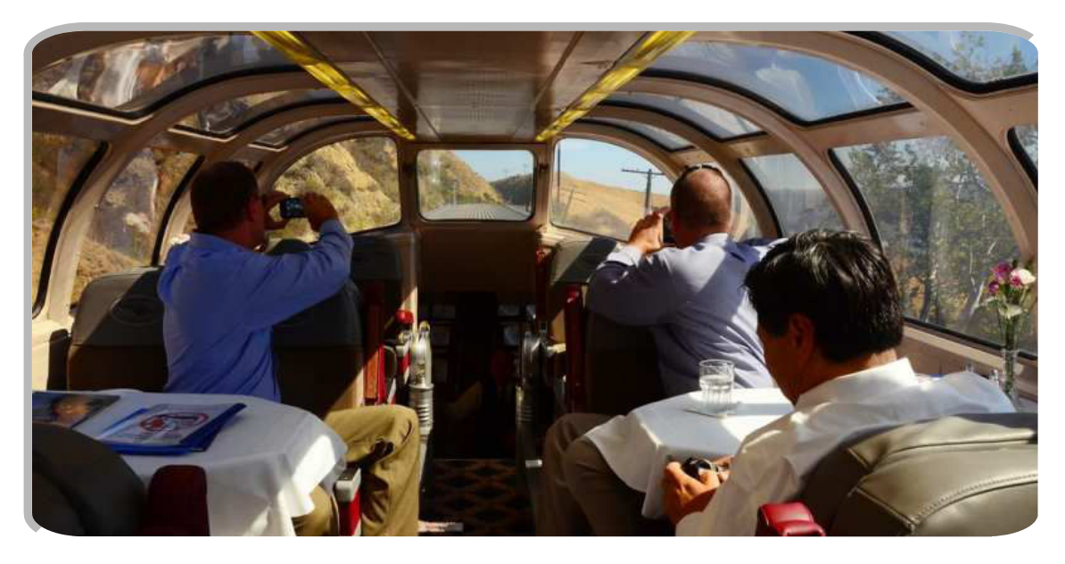
RAIL EXCURSION TO THE HUNTINGTON LIBRARY SATURDAY, FEBRUARY 20TH, 2021 10am PST

NOTE: There is no Parlor Car Chat scheduled for Saturday, February 27th.