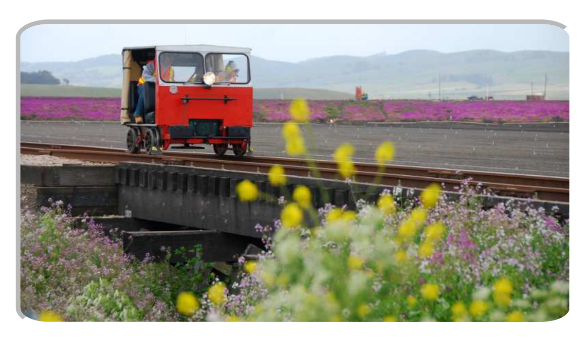
SPEEDERS ON THE SMVRR SATURDAY, MARCH 6TH, 2021 10am PST

https://slorrm.com/parlor-car-chats.html or go to our website: www.slorrm.com.