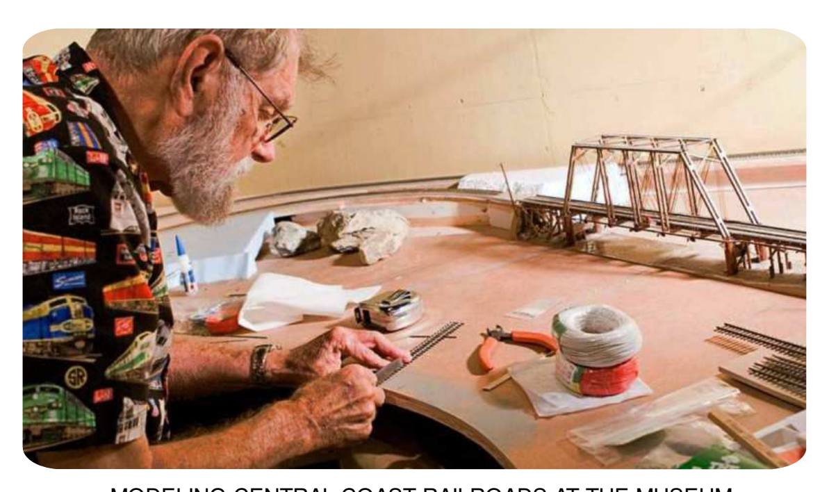
MODELING CENTRAL COAST RAILROADS AT THE MUSEUM SATURDAY, APRIL 24, 2021 10:00 AM PDT

For this session, video and audio are highly recommended in order to see the photos and graphics as well as hear the commentary. Join the talk by using this link: https://slorrm.com/parlor-car-chats.html or go to our website: www.slorrm.com.