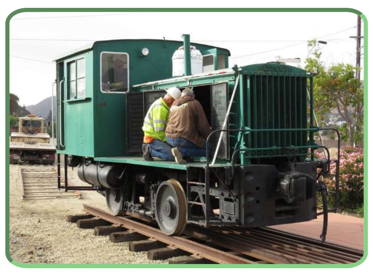
DANNY THE DIESEL HAULS ROCKS