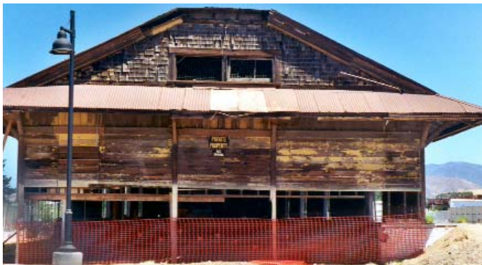
Rotted lower portions of the building were removed. On the south end there was no foundation.

In the Spring of 2004 a contract was awarded to Voss Construction of Atascadero for Phase 1 of the rehabilitation of the Freighthouse. According to City Project Manager Mike McGuire, work that has been completed so far included construction of the foundation, some removal of lead paint, patching the corrugated roofing as needed and completely repairing the wooden upper flat roof area. All of the freight doors have been reinforced and sealed with plywood. The doors probably won't be reinstalled until the appropriate hardware becomes available. This may require some reproduction.