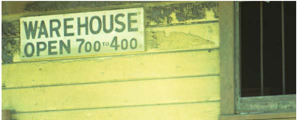
Anybody know what happened to this sign, seen here in 1977.

This is how the Freighthouse looked in 1977. Pretty run down, but still recognizable as a Southern Pacific building. This is the oldest picture of the Freighthouse that the Museum has. If any of you have any older pictures that you would like to donate to the Museum, please contact the Museum by e-mail at info@slorrm.com or by mail at P. O. Box 13260, San Luis Obispo, CA 93406. If you don't want to donate the pictures, please let us scan and copy them.