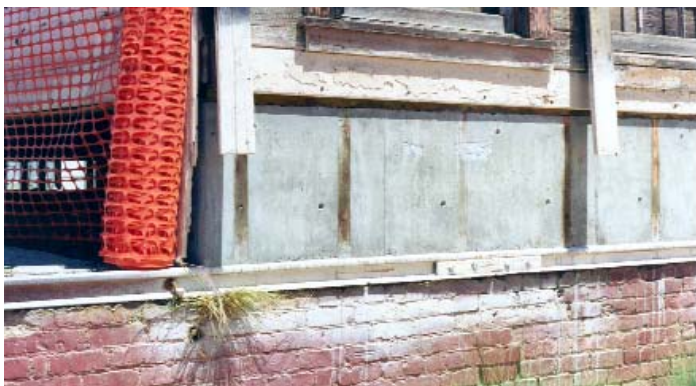
On the rest of the building, the bottom 18" of the frame was removed and a concrete base was poured in its place. The outer wood will be replaced at a later time.