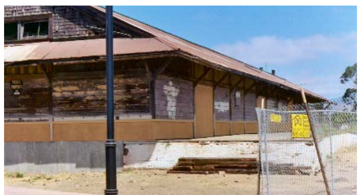
The repaired areas have been covered with plywood to protect them until the original outer wood can be replaced.