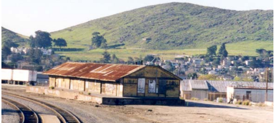
By 1997 the 1894 Freighthouse was in pretty bad shape, although it was being used as a warehouse by Daylight Gardens. More story and pictures on page 4