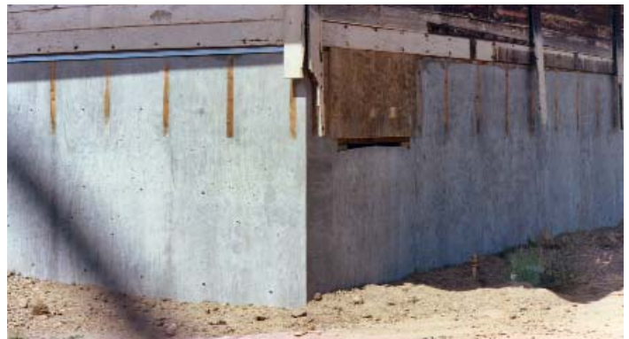
A complete foundation was poured under the south end of the building where none had been before.