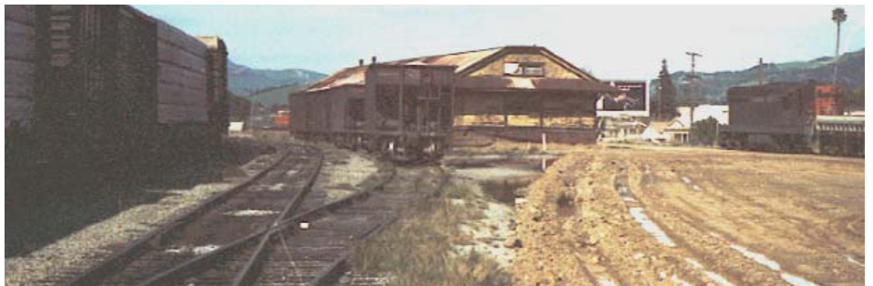
In 1983 there was still lots of activity around the Freighthouse.