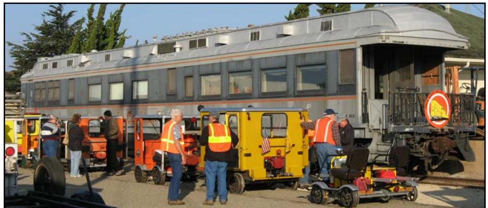
After arriving in Santa Maria, La Condesa is parked by the SMVR offices at 628 South McClelland Street in Santa Maria. A line of speeders that were in town for a Motor Car Operators West (MOW) meet can be seen sitting on the adjoining track.