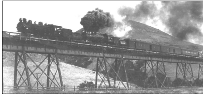
Train No. 21 crossing Stenner Creek trestle circa 1915. Kelsey Thorne, 1912