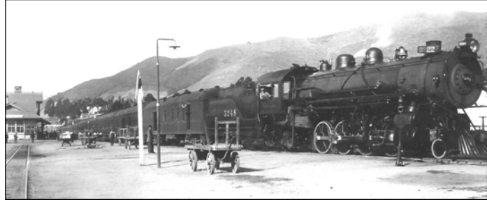
Train No. 22 at San Luis Obispo circa 1915.