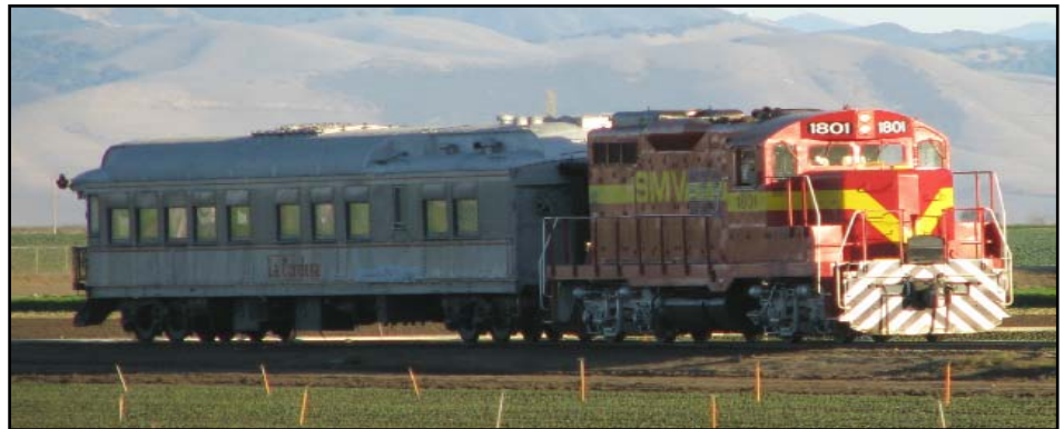
La Condesa speeds across the bean fields, pulled by Santa Maria Valley Railroad's GP-9 number 1801, on its way from Guadalupe to Santa Maria.

After arriving in Guadalupe around noon, the 1926 Pullman Observation Car was coupled to Santa Maria Valley Railroad's Geep-9 and hauled to Santa Maria where it sits today.