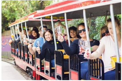
Santa Maria Sun: ICYMI: The Roar and Pour might be over and done, but the... (Read more)