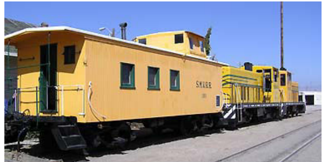
September 2, 2004. SMVRR Caboose No. 180 is placed at the depot by back-to-back SMVRR 70-tonners.

The car was then purchased by Betteravia Farms and spent many years on the end of a spur track off S. Blosser road, where it had fallen into disrepair. The caboose attracted the attention of the railroad museum in 1999, and when asked, Milo Ferini, owner, donated the caboose to the museum. 🚦