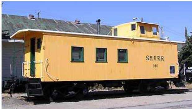
SMVRR Cabosse No. 180 was restored by the SMVRHM.

Significant locomotives from the Valley's past have slipped from our grasp over the years, such as the Santa Maria Valley Railroad (SMVRR) No. 205 that used to be on display at the Fairgrounds, and No. 21, the SMVRR's most well-known locomotive. Together, we can get U.S. No. 1 back for good!