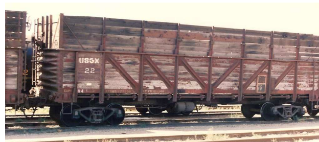
A Union Sugar beet gondola.

Currently in storage at the California State Railroad Museum in Jamestown, CA, this 0-4-0T steam locomotive was originally built as the Chicago, Rock Island & Pacific No. 84 (CRI&P) in 1884.