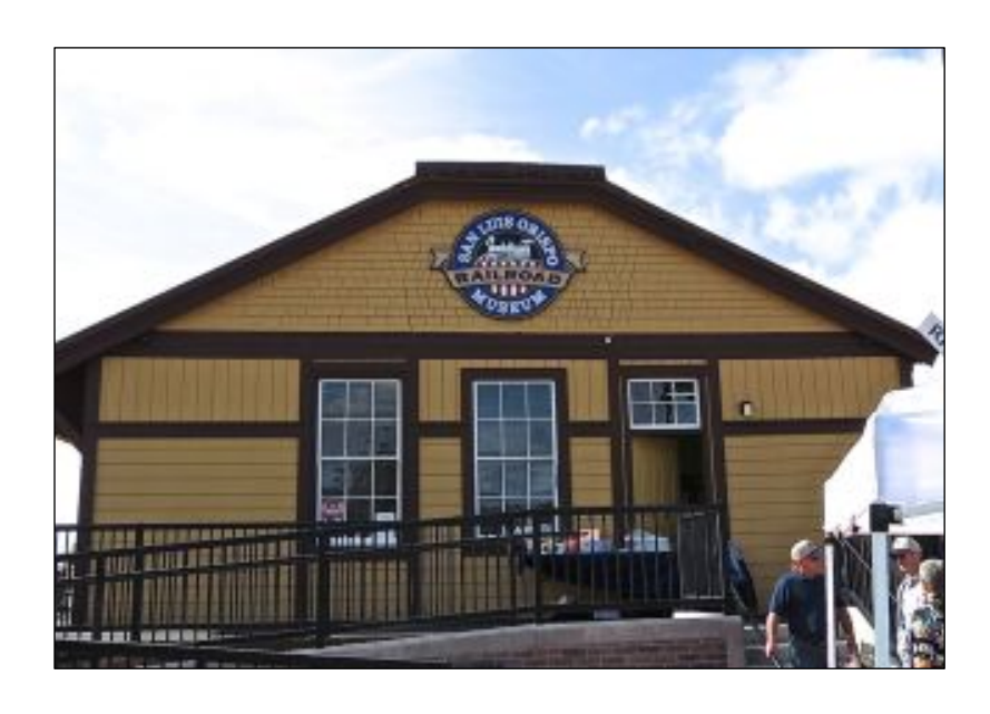
Promoting California Central Coast railroad heritage through community participation, education, and historic preservation.