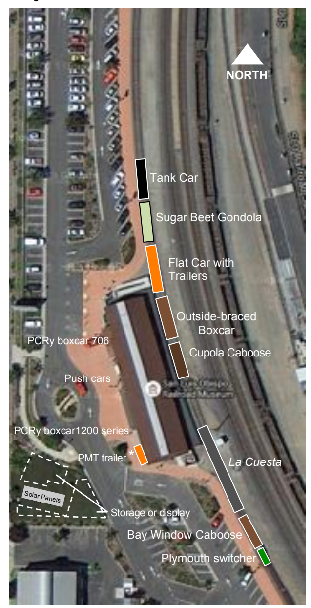
* Temporary location for PMT trailer Precise location of cars is subject to change.