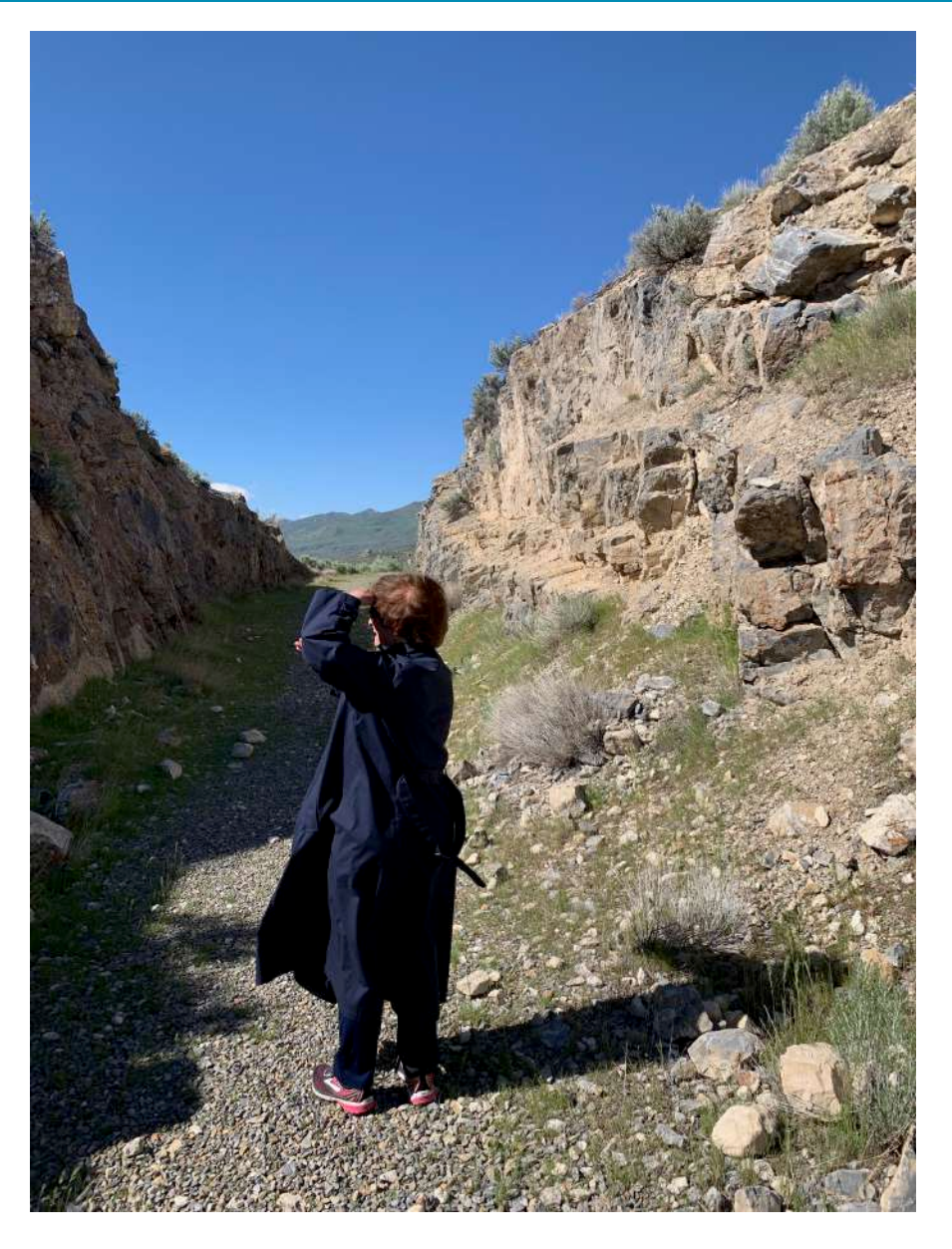
Inside the Union Pacific cut camera looking westbound.